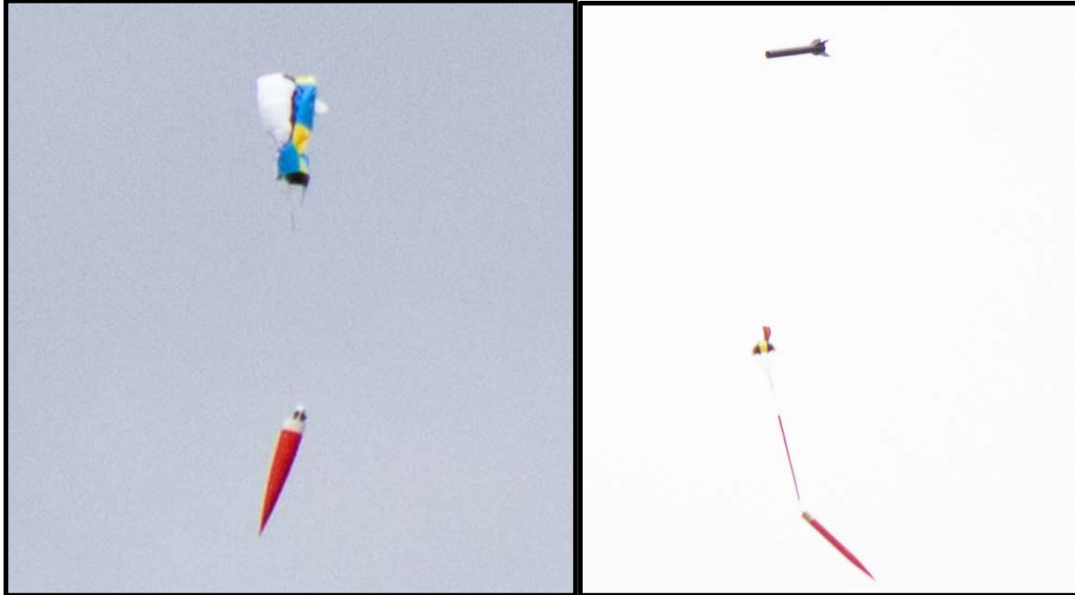
Payload during descent with a loose brake line

The parafoil could be observed throughout its entire descent. We observed the rocket elements separate nominally with the main parachute and tracked both sections as they descended.